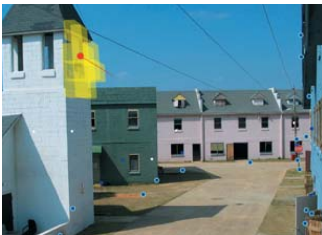
GUNSHOT LOCATION and trajectory (red dot and line) were triangulated within seconds by a network of microphone-equipped motes (blue dots). In tests at Fort Benning, Ga., the system pinpointed rifle shots even when some motes (white dots) had no clear line of sight to the muzzle blast.

Motes that lack vibration sensors may ignore the message; others may turn on their sensors if they have been sleeping; still others may run a series of calculations on the data logged in their memories, extract readings that meet the requested crite-