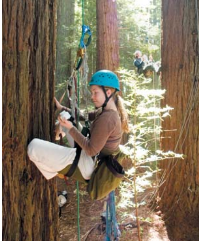
INSTALLATION in April of dozens of smart sensors throughout redwoods created a network that works as a “macroscope.”

They are designed to be inexpensive enough for deployment in large numbers to gather very detailed information about the environment. Networks of them are dense enough that it is ac-