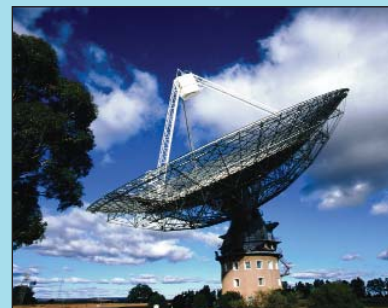
Blip, blip. Australia's 64-meter Parkes Radio Telescope finds pulsars in bunches.

dead star known to have a planetary system.