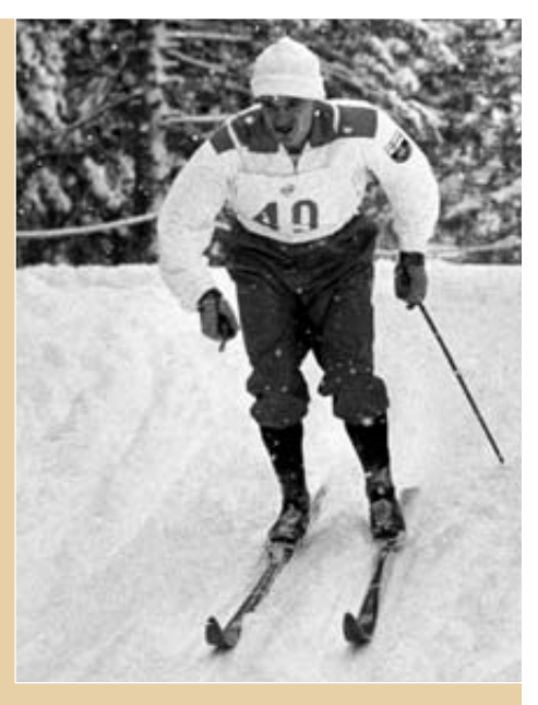
EERO MÄNTYRANTA won two Olympic gold medals in 1964. Years later scientists found the source of the Finnish cross-country skier's endurance. A genetic mutation gave his family higher than normal levels of oxygen-carrying red blood cells higher even than could be achieved with EPO.

But would it constitute an unfair advantage in an athlete, and would it justify other competitors using myostatin-inhibiting drugs or gene therapy simply to level the playing