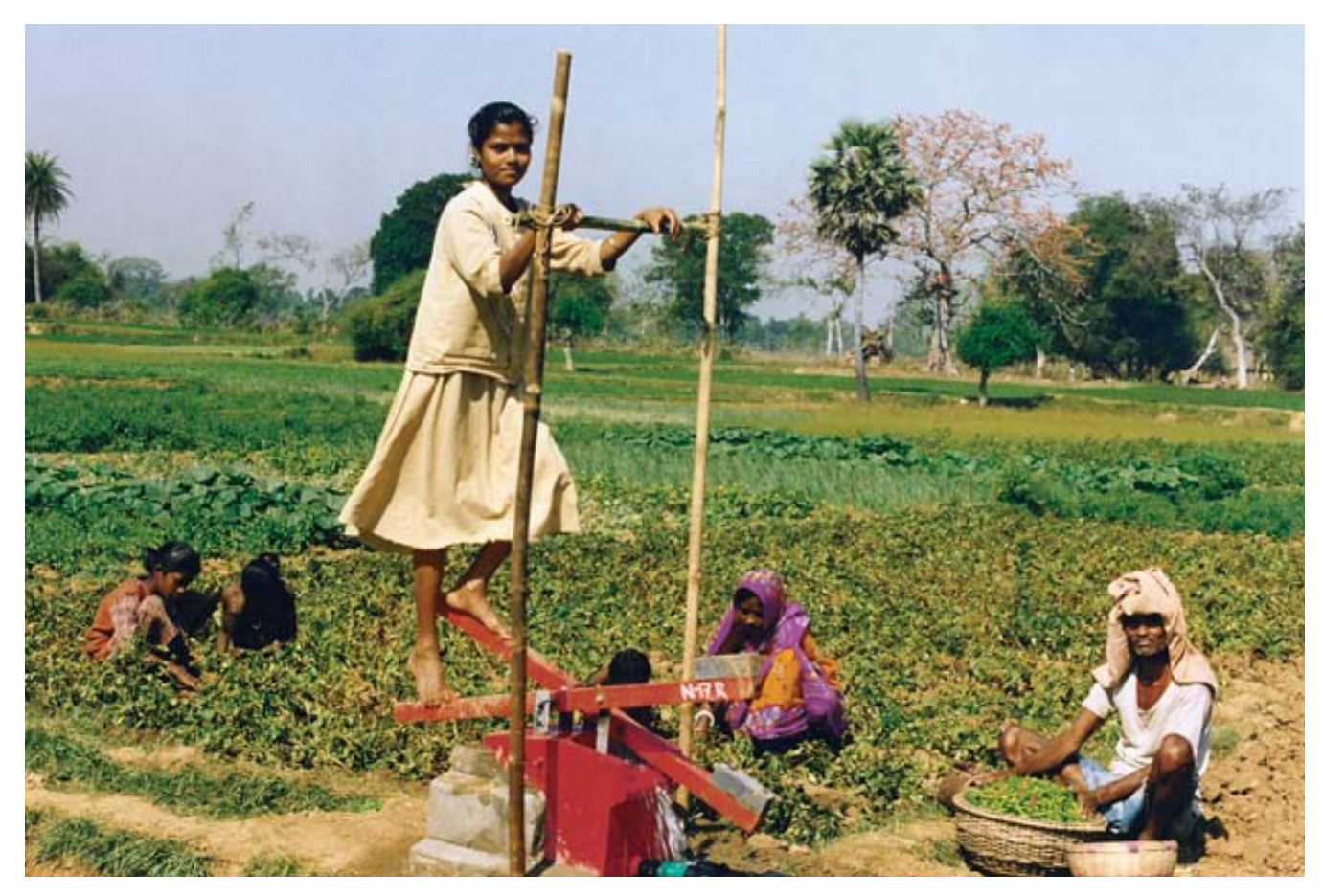
TREADLE PUMPS have been adopted by many small farmers in Bangladesh and India because they cost only $25. A farm family using the pump to irrigate a half-acre plot can earn several times that amount

more. In 2004 farmers in India purchased enough IDE equipment to irrigate 20,000 acres. Within 10 years I expect that low-cost drip systems will irrigate several million hectares in India alone, an amount larger than the total worldwide area under drip irrigation today.