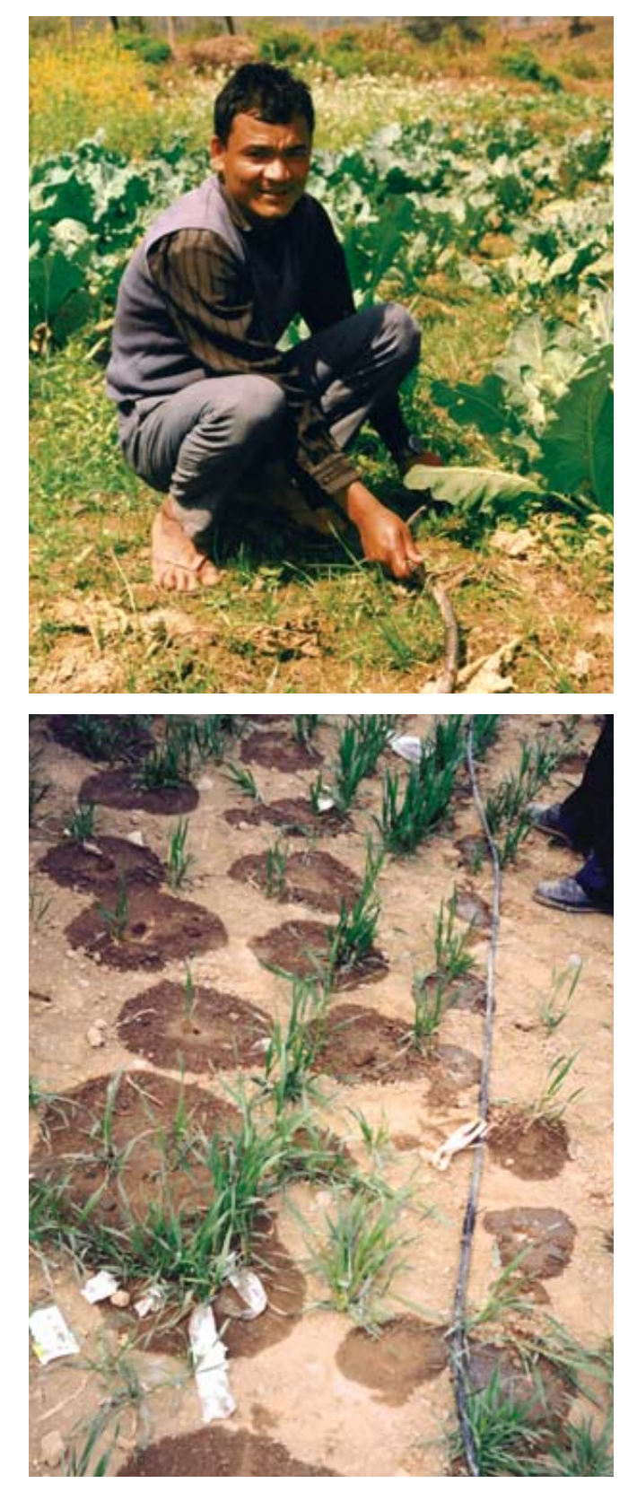
DRIP IRRIGATION brings water to vegetables grown in the hill villages of Nepal (top). International Development Enterprises was able to make the system affordable by using cheap plastic piping. The drip lines deliver water directly to the roots of the crops (bottom).

about 2,500 cubic kilometers of water every year, and the consensus is that even with improvements in productivity they will require about 20 percent more by 2025.